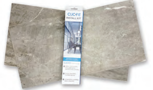
The install kit provides all the tools you need for a seamless installation.