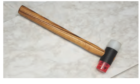
The perfect tool to pair with your ClicFit™ Install Kit to make installation a breeze.