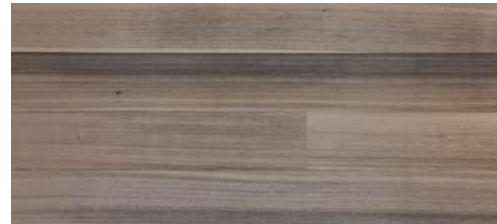
SHEFFIELD TASMANIAN OAK