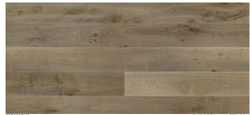
RICHMOND EUROPEAN WHITE OAK