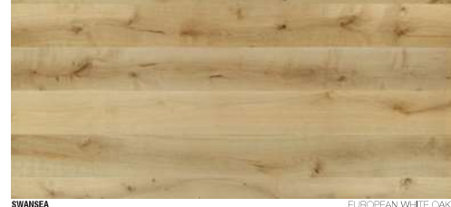
SWANSEA EUROPEAN WHITE OAK