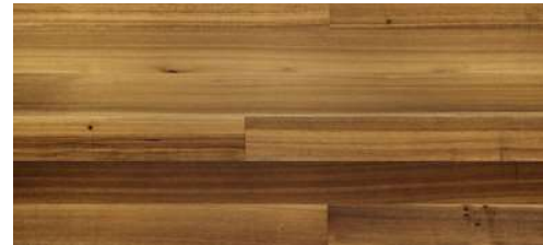
BRUNY TASMANIAN OAK