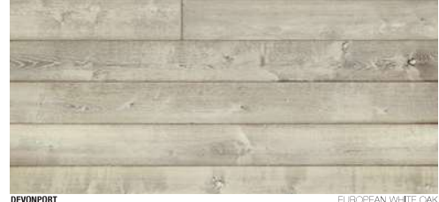
DEVONPORT EUROPEAN WHITE OAK