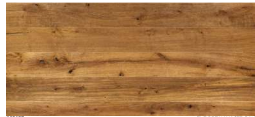
HOBART EUROPEAN WHITE OAK