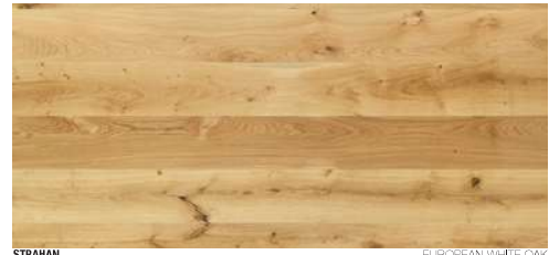
STRAHAN EUROPEAN WHITE OAK