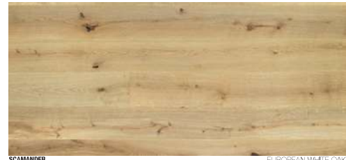
SCAMANDER EUROPEAN WHITE OAK