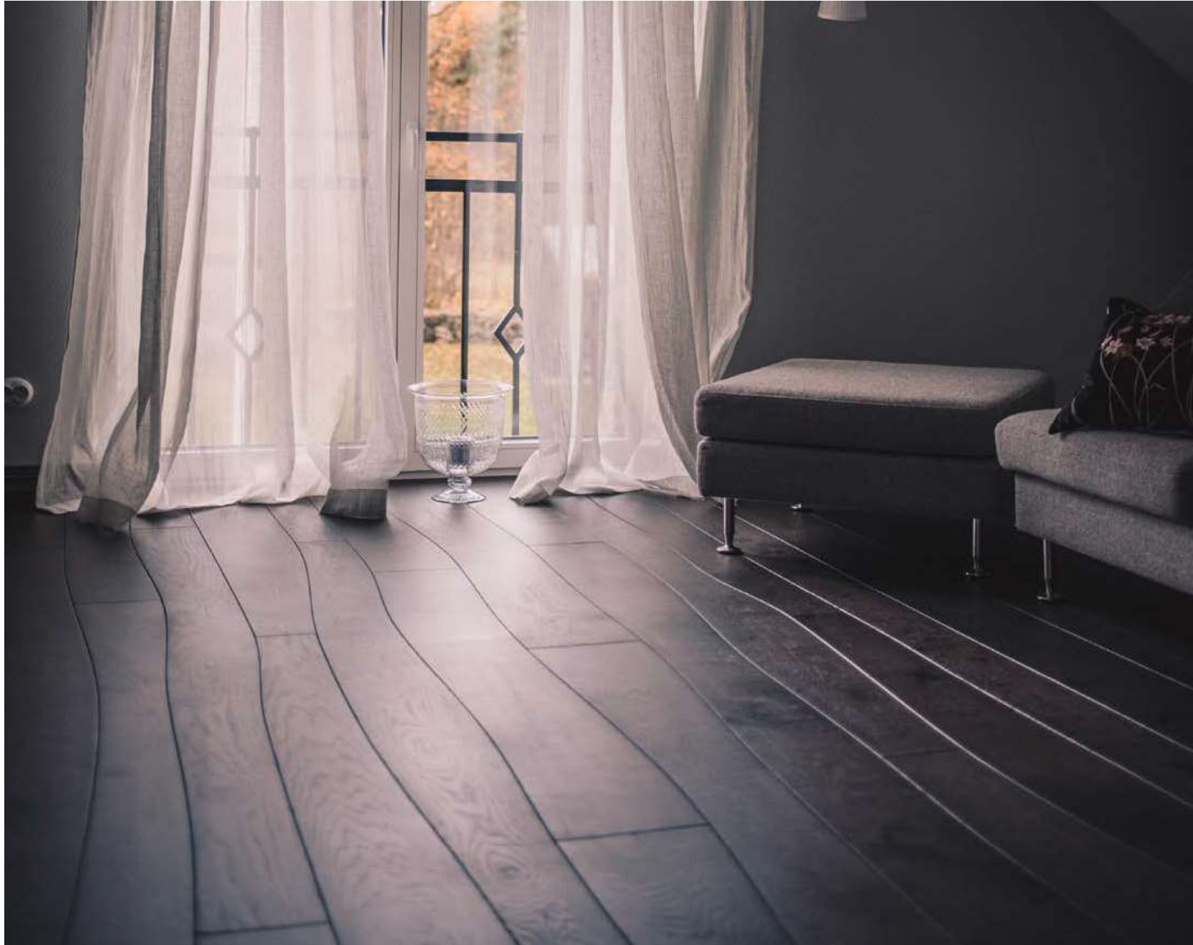
Private house Estonia Oak Natural, Godafoss